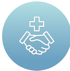
The Care Partner