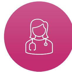
The Healthcare Worker

Through Sept. 2025, we will be supporting three groups impacted by brain diseases in Moore County: